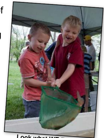
Look what WE Found!

**SPECIAL GUESTS** The Blue Ridge Wildlife Center of Virginia! They will present a live animal program with animals and birds from the Valley.