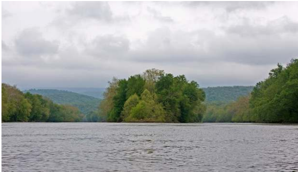
Help Friends Protect Our River.